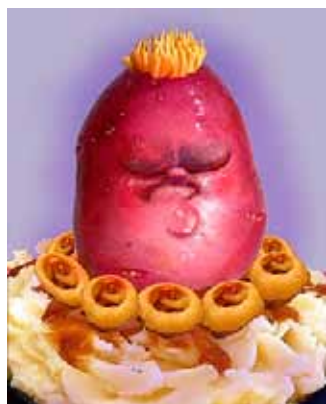
Mr. Potato Head