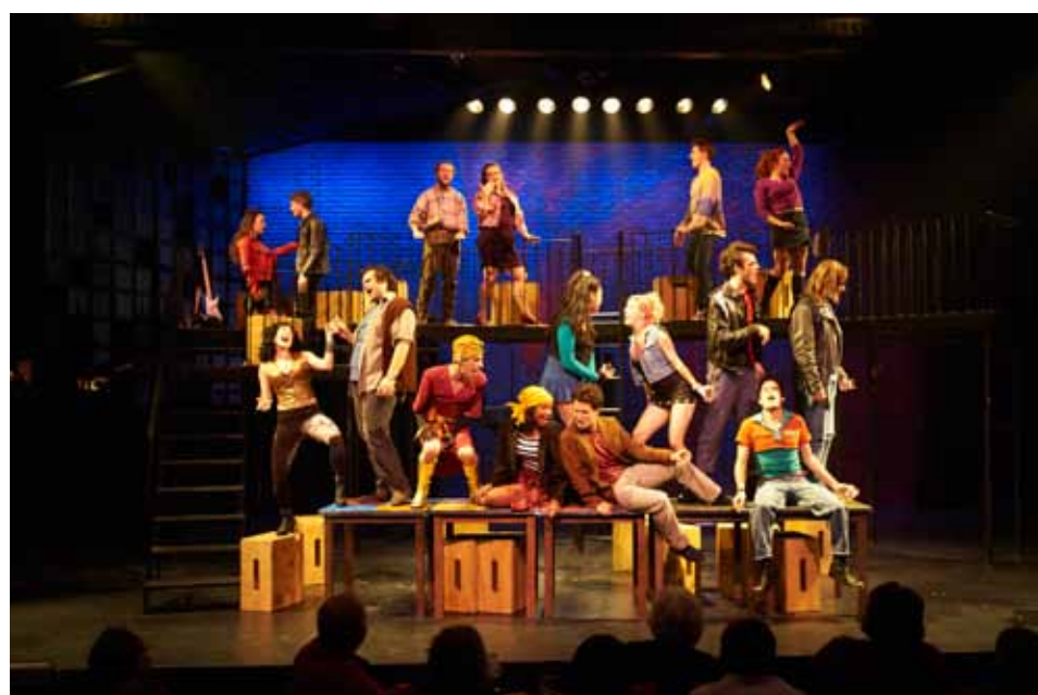
Production photo of Rent.

■ The sold out Theatre Sheridan production of Rent raised over $600 for Casey House.